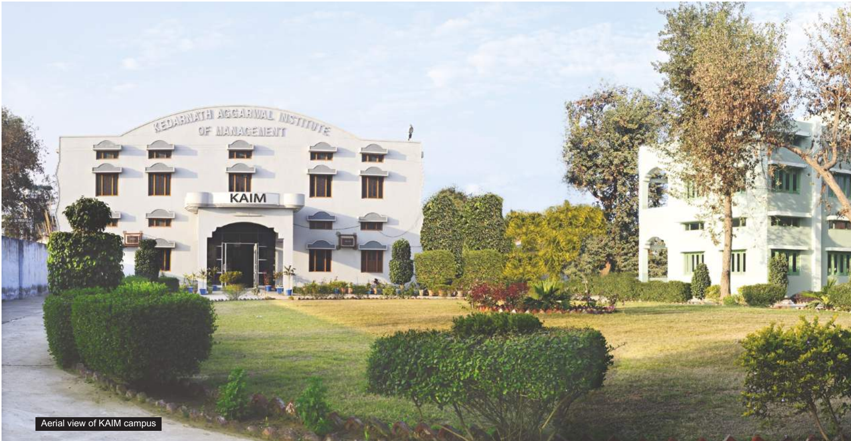
Aerial view of KAIM campus